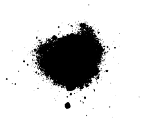
BLACK CMYK (0, 0, 0, 100)

You do not have to worry about colours of your graphic solution. You will get away just with black, red and white.