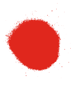
RED CMYK (2, 94, 94, 1) PANTONE 485 C